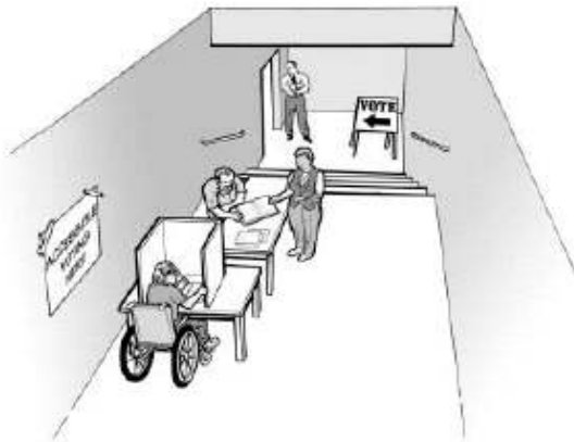
An accessible voting station is provided on an accessible level in a facility where voting occurs downstairs.

of temporary solutions as opposed to permanent structural modifications.